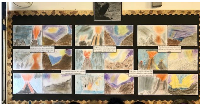
Y3 Art display of Volcanos

In Year 3 we are learning about volcanoes and earthquakes. We have learnt that volcanoes' magma makes a new crust on the volcano when it erupts, and a volcano is made by two plates under the earth that crash together forming a volcano. There are many active in the Philippines but thankfully we don't have any in England. Plum, Y3